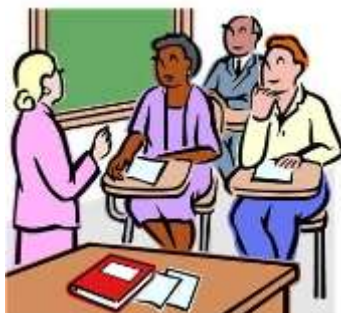
Practical training for medical students