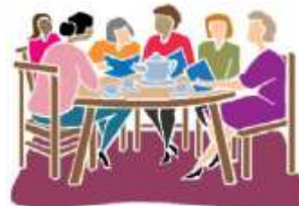
Peer Support Meetings