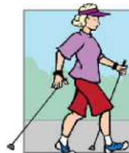
Promotion of exercise such as Nordic Walking