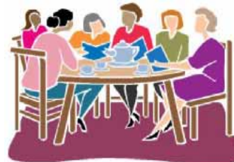
Peer Support Meetings