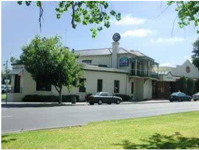
International Spondylitis Day @ Berwick Inn May 2016.