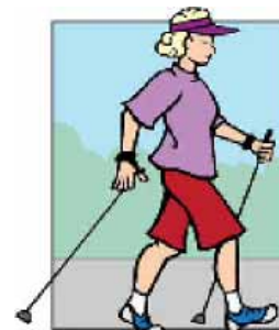
Promotion of exercise such as Nordic Walking